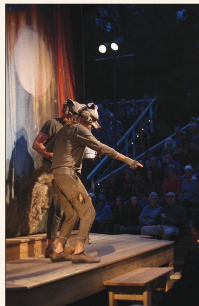
CARAVAN FARM THEATRE

The Guy Next Door — clothing consignment shop with an admiration for all things vintage. Located in the heart of downtown, directly beside Frugal Frocks. 3450 Okanagan Street, Armstrong, BC 250-546-0950 Facebook: theguynextdoorvintage