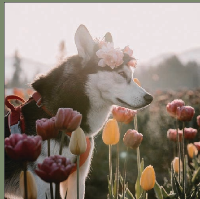
BLOOM FLOWER FESTIVAL PHOTO: CRICKET IN THE THICKET

Visit www.aschamber.com/tourismarmstrong for more details on things to do, or stop by the Visitor Centre.