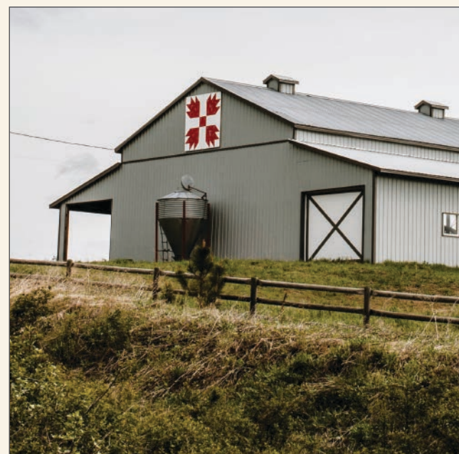
BARN QUILT TRAIL

There are also many other visual and performing arts throughout the region. Wander through downtown Armstrong stores to find many unique forms of art.