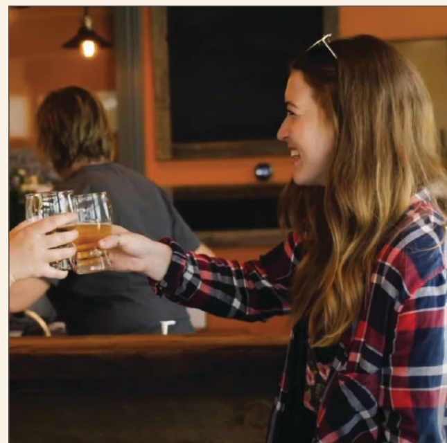
FARMSTRONG CIDER