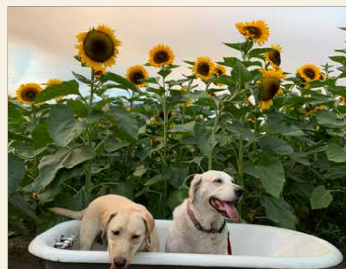
BLOOM FLOWER FESTIVALS