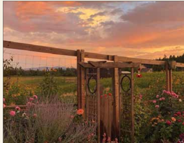
SPALLUMCHEEN, ADI SCHLACK